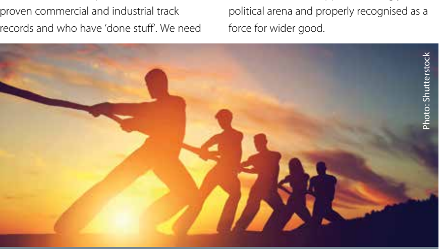
A nation pulled in different directions

A growing and prosperous economy is absolutely fundamental to capitalising on our other assets. If we are to address the need for better public services we need a better private sector. Enterprise therefore needs to be advocated and supported strongly in the political arena and properly recognised as a force for wider good.