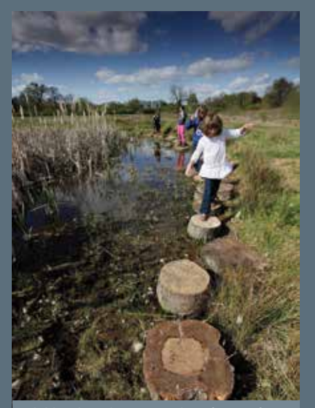
Children have been major beneficiaries fron the ALSF

for community use, equivalent to between £112,000 and £168,000 for a ten to 15-year operating life.