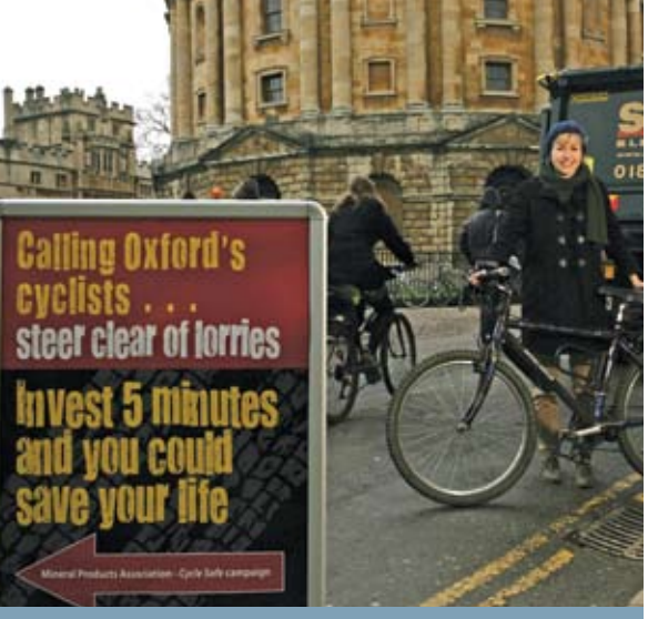
Above: Cycle Safe launch in Oxford Below: deliverina the message in Yorkshire